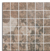
1094407 - 2"x2" Mosaic (12"x12")