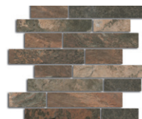
1094486 12"x12" Listello Mosaic