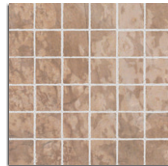
1094406 - 2"x2" Mosaic (12"x12")