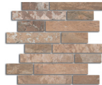
1094487 12"x12" Listello Mosaic