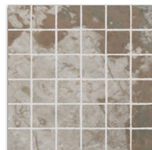
1094404 - 2"x2" Mosaic (12"x12")