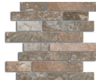
1094485 12"x12" Listello Mosaic