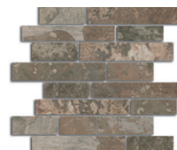
1094488 12"x12" Listello Mosaic