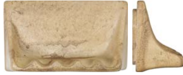
CAST STONE BATHROOM FIXTURE NOCE SOAP DISH – RECESSED MOUNT 33-020