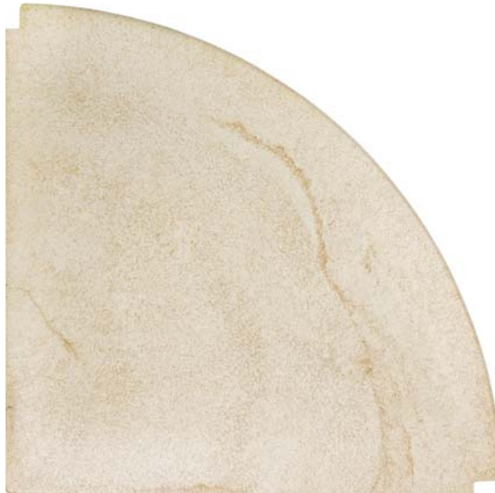
CAST STONE BATHROOM FIXTURE IVORY CORNER BENCH – RECESSED MOUNT 33-004