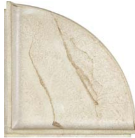
CAST STONE BATHROOM FIXTURE IVORY FLARED CORNER SHELF – RECESSED MOUNT 33-005