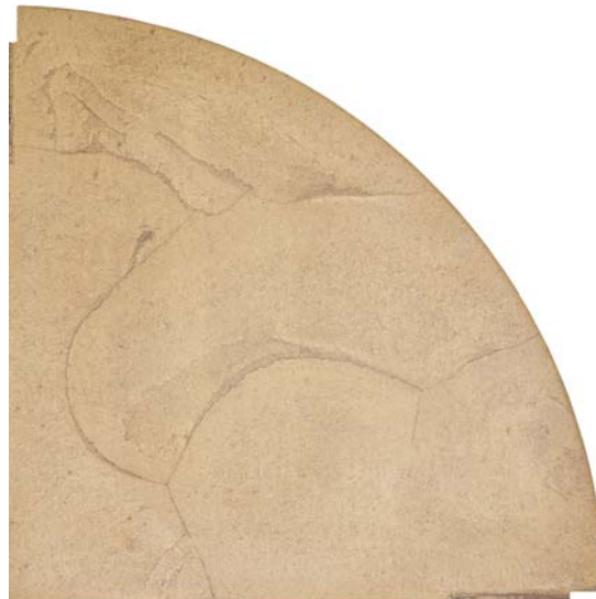
CAST STONE BATHROOM FIXTURE NOCE CORNER BENCH – RECESSED MOUNT 33-024