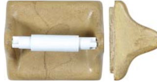
CAST STONE BATHROOM FIXTURE NOCE TISSUE HOLDER – RECESSED MOUNT 33-021