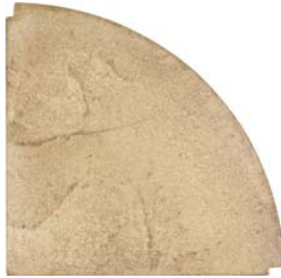
CAST STONE BATHROOM FIXTURE NOCE CORNER SHELF – RECESSED MOUNT 33-023