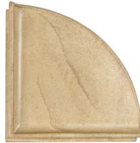
CAST STONE BATHROOM FIXTURE NOCE FLARED CORNER SHELF – RECESSED MOUNT 33-025