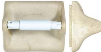
CAST STONE BATHROOM FIXTURE IVORY TISSUE HOLDER – RECESSED MOUNT 33-001