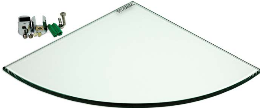
9" x 9" TEMPERED GLASS CORNER SHELF - 8mm SURFACE MOUNT WITH HARDWARE 33-049