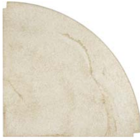
CAST STONE BATHROOM FIXTURE IVORY CORNER SHELF – RECESSED MOUNT 33-003