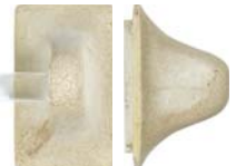
CAST STONE BATHROOM FIXTURE IVORY TOWEL BAR SET – RECESSED MOUNT 33-002