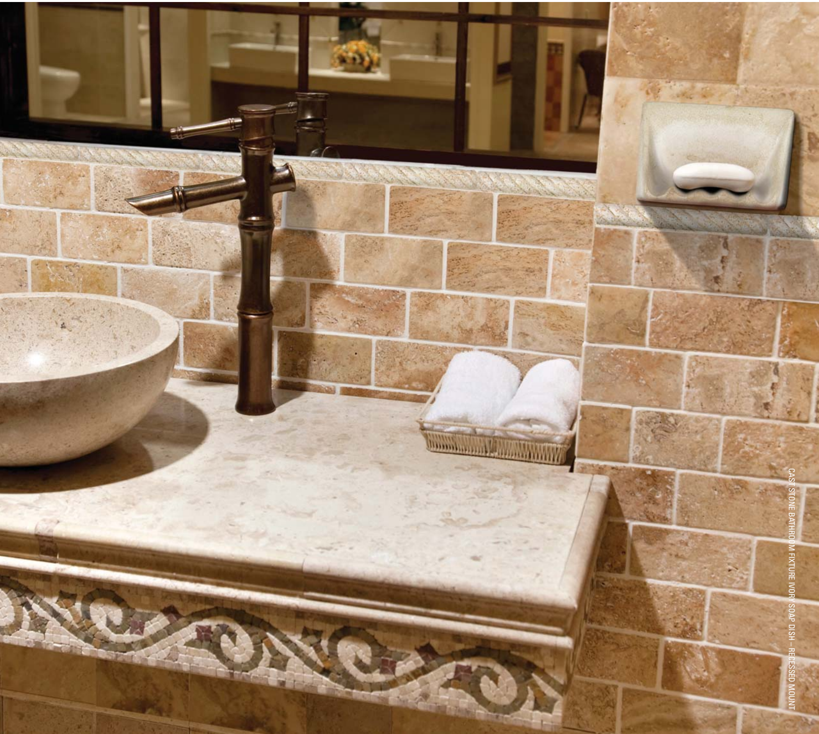
CAS STONE BATHROOM FIXTURE - MOPR SOAP DISH - RECESSED MOUNT