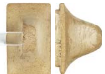
CAST STONE BATHROOM FIXTURE NOCE TOWEL BAR SET – RECESSED MOUNT 33-022