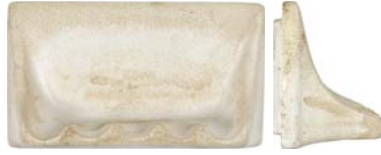
CAST STONE BATHROOM FIXTURE IVORY SOAP DISH – RECESSED MOUNT 33-000