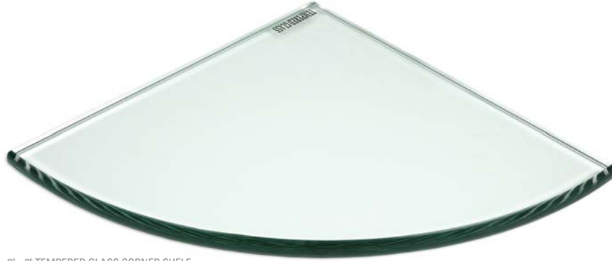
9" x 9" TEMPERED GLASS CORNER SHELF - 12mm RECESSED MOUNT 33-048