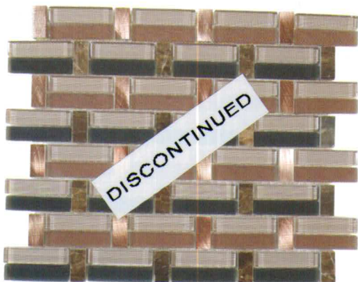
BW-501 MAUVE MEMORIES