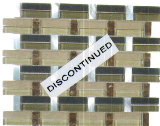
BW-502 PEBBLE TRAIL