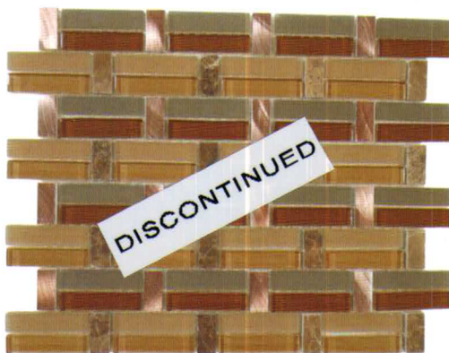
BW-504 SEA GRASS