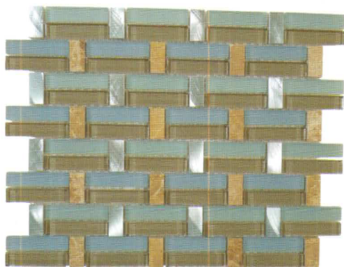
BW-505 PACIFIC SURF