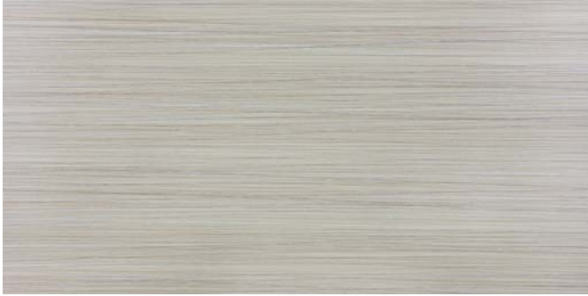
12" x 24" ZERA ANNEX WALNUT RECTIFIED PORCELAIN TILE 69-145