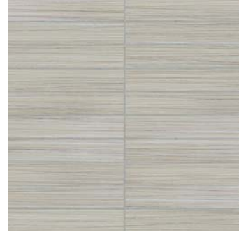
1" x 6" ZERA ANNEX WALNUT RECTIFIED STACKED MOSAICS 69-153