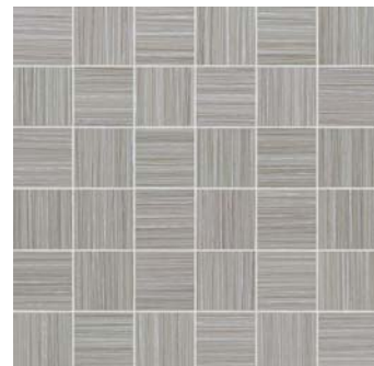
2" x 2" ZERA ANNEX OLIVE PORCELAIN MOSAICS 69-321