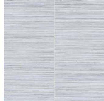
1" x 6" ZERA ANNEX SILVER RECTIFIED STACKED MOSAICS 69-162