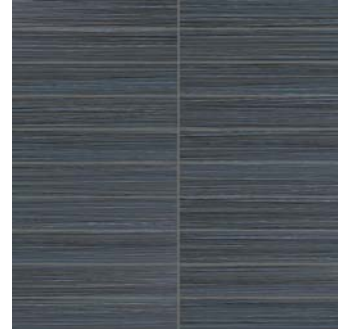
1" x 6" ZERA ANNEX CARBON RECTIFIED STACKED MOSAICS 69-155