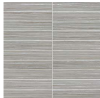
1" x 6" ZERA ANNEX OLIVE RECTIFIED STACKED MOSAICS 69-154