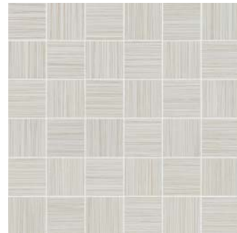
2" x 2" ZERA ANNEX SAND PORCELAIN MOSAICS 69-319