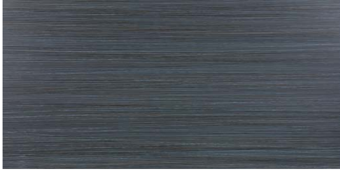
12" x 24" ZERA ANNEX CARBON RECTIFIED PORCELAIN TILE 69-149