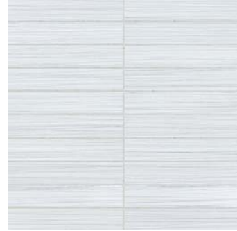
1" x 6" ZERA ANNEX OYSTER STACKED RECTIFIED MOSAICS 69-151