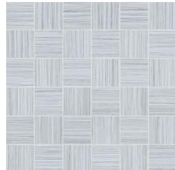
2" x 2" ZERA ANNEX SILVER PORCELAIN MOSAICS 69-324