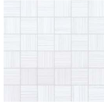
2" x 2" ZERA ANNEX BIANCO PORCELAIN MOSAICS 69-323