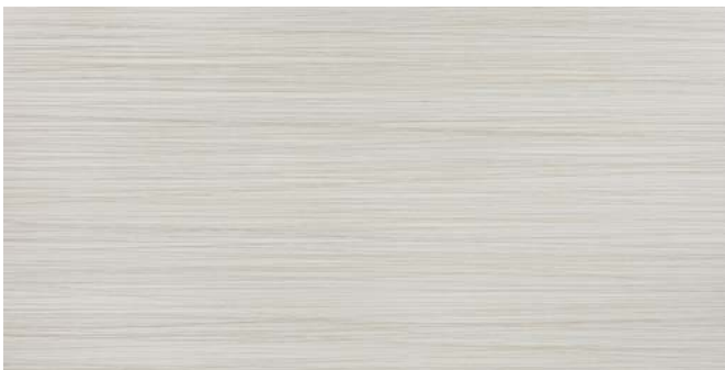
12" x 24" ZERA ANNEX SAND RECTIFIED PORCELAIN TILE 69-143