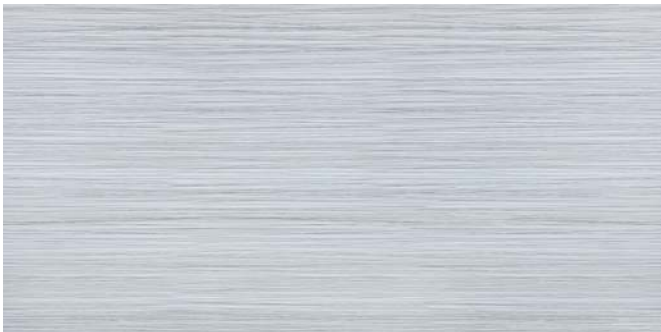
12" x 24" ZERA ANNEX SILVER RECTIFIED PORCELAIN TILE 69-159