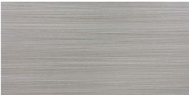
12" x 24" ZERA ANNEX OLIVE RECTIFIED PORCELAIN TILE 69-147