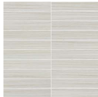
1" x 6" ZERA ANNEX SAND RECTIFIED STACKED MOSAICS 69-152