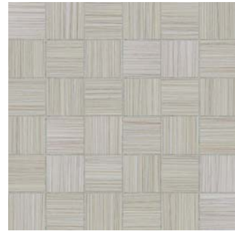
2" x 2" ZERA ANNEX WALNUT PORCELAIN MOSAICS 69-320