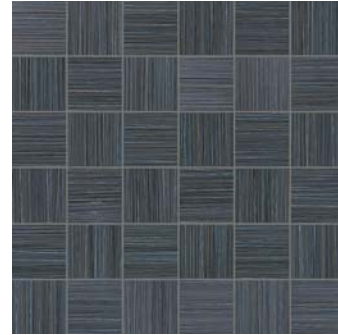
2" x 2" ZERA ANNEX CARBON PORCELAIN MOSAICS 69-322