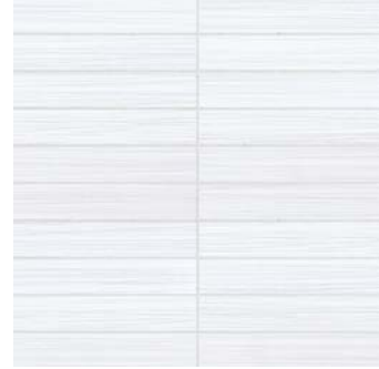
1" x 6" ZERA ANNEX BIANCO RECTIFIED STACKED MOSAICS 69-161