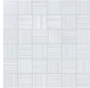
2" x 2" ZERA ANNEX OYSTER PORCELAIN MOSAICS 69-318