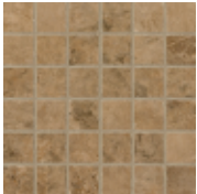
1093259 2"x2" Mosaic (12"x12")