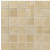
1093258 2"x2" Mosaic (12"x12")