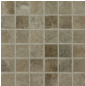
1093261 2"x2" Mosaic (12"x12")