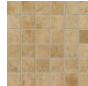
1093260 2"x2" Mosaic (12"x12")