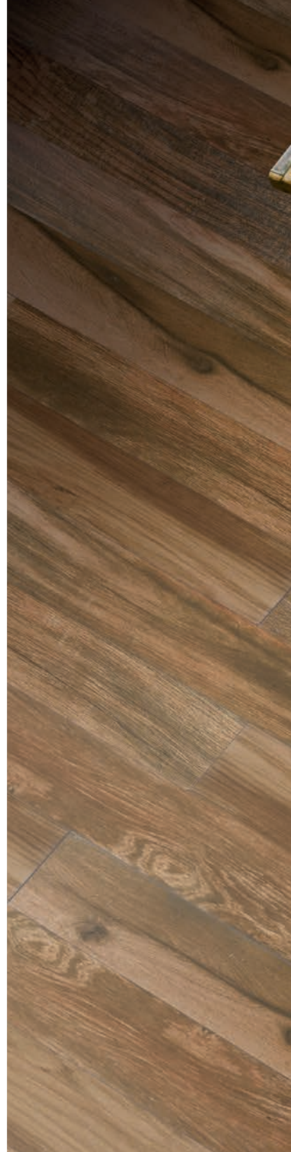
santa monica 6"x36"