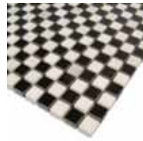
T728 - Black Marble/White Statuary (Polished)