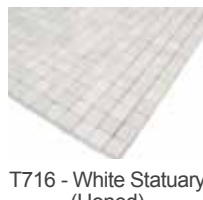
T716 - White Statuary (Honed)