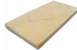
T762 - Crema Marfil (Polished)