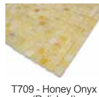
T709 - Honey Onyx (Polished)