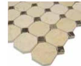
T782 - Crema Marfil/Emperador (Polished)