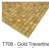
T708 - Gold Travertine (Honed)