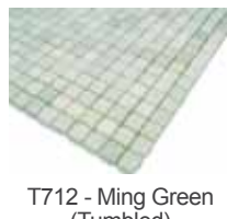
T712 - Ming Green (Tumbled)