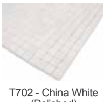
T702 - China White (Polished)