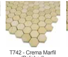
T742 - Crema Marfil (Polished)