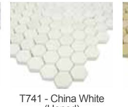
T741 - China White (Honed)