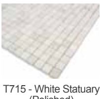
T715 - White Statuary (Polished)