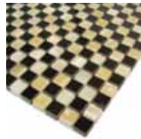
T727 - Honey Onyx/Black Marble (Polished)