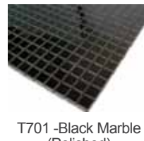
T701 -Black Marble (Polished)