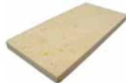
T763- Crema Marfil (Honed)