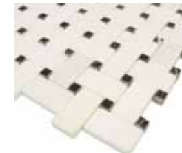
T792 - China White/Black Marquina (Polished)