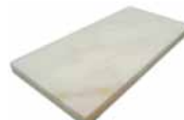
T768- White Statuary (Polished)