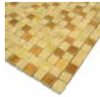
T725 - Honey Onyx/Crema Marfil/ Timber (Polished)