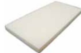
T761 - China White (Honed)