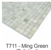
T711 - Ming Green (Polished)