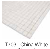
T703 - China White (Honed)