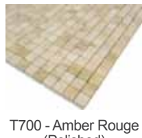
T700 - Amber Rouge (Polished)