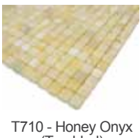
T710 - Honey Onyx (Tumbled)