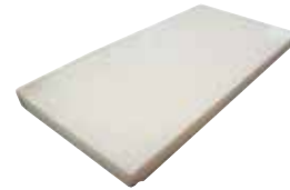
T760 - China White (Polished)