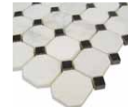
T783 - White Statuary/Black Marquina (Polished)