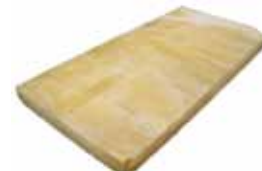
T764- Honey Onyx (Polished)