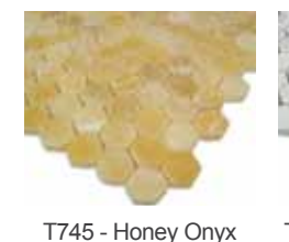
T745 - Honey Onyx (Honed)