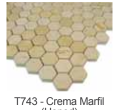
T743 - Crema Marfil (Honed)