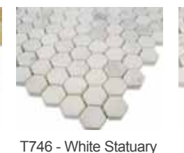
T746 - White Statuary (Polished)