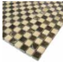
T726 - Crema Marfil/Emperador Dark (Polished)