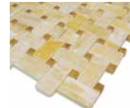
T793 - Honey Onyx/ Timber (Polished)