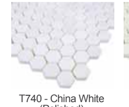
T740 - China White (Polished)