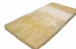
T765- Honey Onyx (Honed)