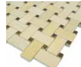
T791 - Crema Marfil/Emperador Dark (Polished)