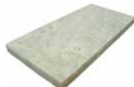
T766- Ming Green (Polished)