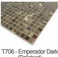
T706 - Emperador Dark (Polished)