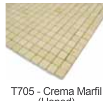
T705 - Crema Marfil (Honed)