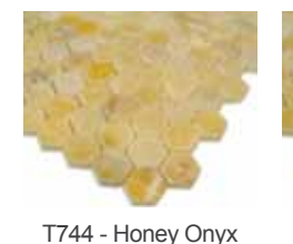
T744 - Honey Onyx (Polished)