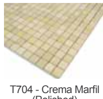
T704 - Crema Marfil (Polished)