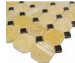
T781- Honey Onyx/Black Marble (Polished)