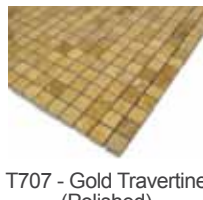
T707 - Gold Travertine (Polished)