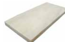
T769- White Statuary (Honed)