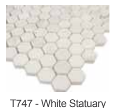
T747 - White Statuary (Honed)