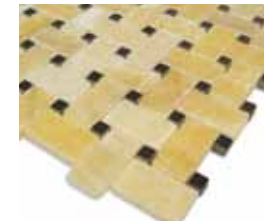
T790 - Honey Onyx/Black Marble (Polished)