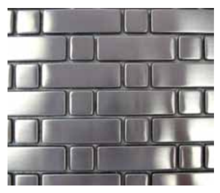
TML03 Rectangles & Squares