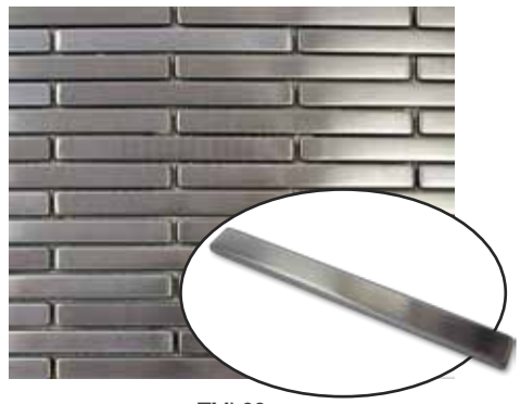
TML09 Edger/Thin Brick