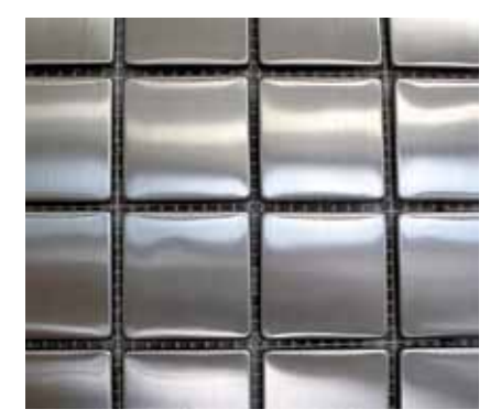
TML02 Medium Square Mosaic - 1 7/8"