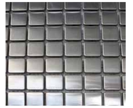
TML01 Small Square Mosaic - 7/8"

backsplashes, feature walls or decorative borders, kitchen, or hallway. The fashionable and visually attractive Metal Series ^{\text{TM}} tiles consist of a porcelain tile body wrapped in stainless steel for clean geometric looks.