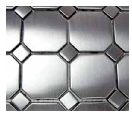
TML07 Octagon & Dots