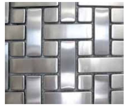
TML05 Basket Weave