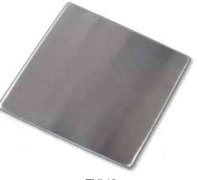
TML12 Large Squares - 4"x4"